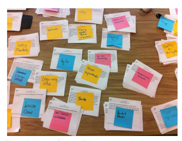
Figure 2. Photo of some of the subcategories that emerged during the open card sort.

also identified the need to seed the survey with data analytics questions. We supplied the following seed questions from the pilot responses, Greg Wilson's list [9], and from our own experiences: