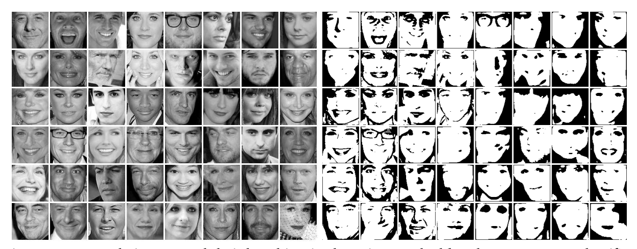
Figure 4: Grayscale images and their best binarized versions ranked low by our Mooney classifier.