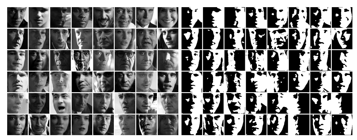
Figure 3: Grayscale images and their best binarized versions ranked high by our Mooney classifier.