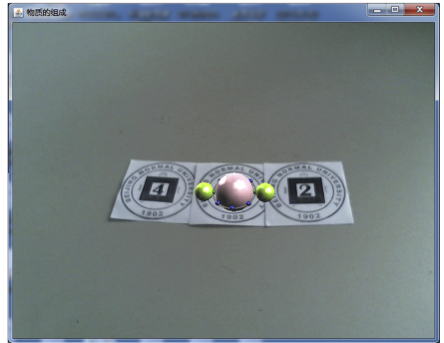
Fig. 4. Three atoms form a water molecule.