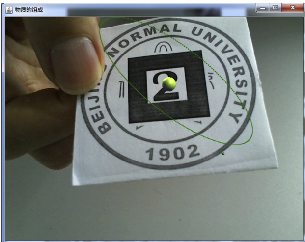
Fig. 2. The electron revolves around the nucleus.