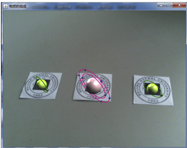
Fig. 3. Models of three atoms.