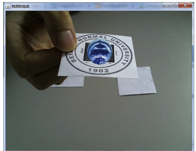
Fig. 6. Water molecules form a real water drop.