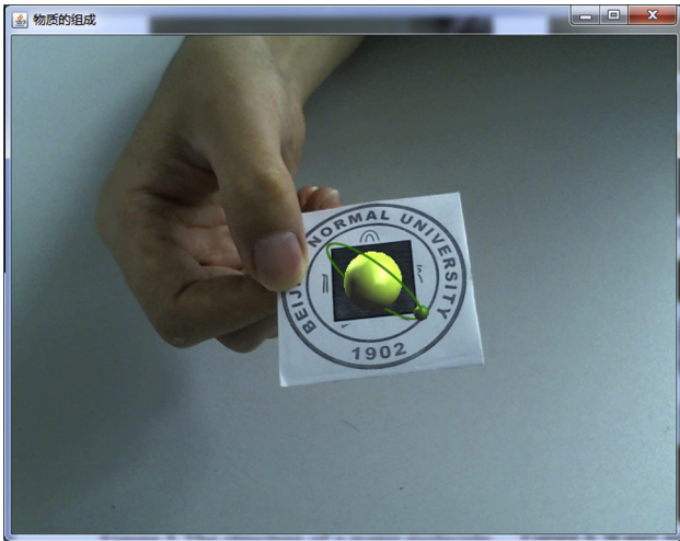
Fig. 1. Hydrogen atom model.