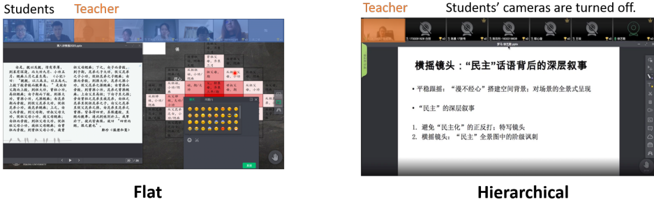
Fig. 5. Flat vs. Hierarchical Structure-ClassIn

teaching platform can be changed manually. As Figure 3 shows, the professional platforms classIn, which has a similar view with videoconferencing system, could be used in both flat and hierarchical structure. Teachers and students in China were more used to adopting hierarchical view, in which teachers are the "streamers," and students are the audience. It is aligned with the traditional teacher-centered relationship between teachers and students in China, where the teacher is positioned either up front in the classroom or is located as the very first in the profile display, illustrated in Figure 5. Students can see teachers, but teachers can only perceive students through text comments or audio required by students. Although these platforms provided video windows for students, their windows were often closed or their cameras were turned off by the teachers to make sure the teachers were the focus. Some teachers often restricted students' rights and did not allow students to open the video and audio at will, so the original flat structure becomes hierarchical, illustrated in Figure 5. Although many teachers adopted a hierarchical structure, students still felt that the gap between teachers and students has become smaller. As S2 (Female, College, ClassIn) said, "Watching the teacher through the live video streaming is like watching the live game streaming. Although I am restricted to use some features, I still feel more free and relaxed compared with offline."