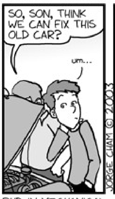
PHD IN MECHANICAL ENGINEERING