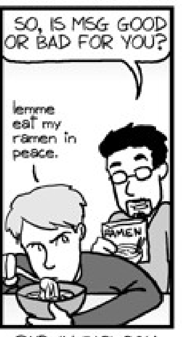
PHD IN BIOLOGY