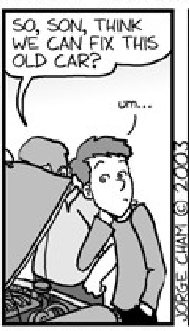
PHD IN MECHANICAL ENGINEERING