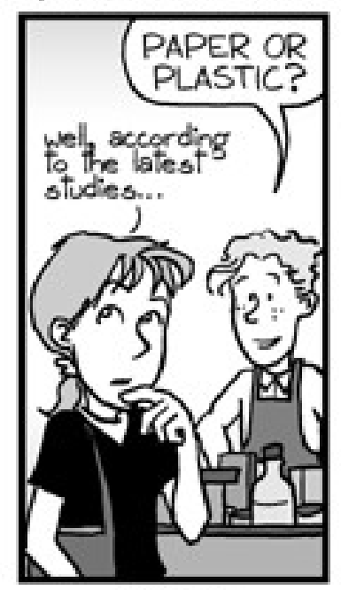
PHD IN ENVIRONMENTAL ENGINEERING