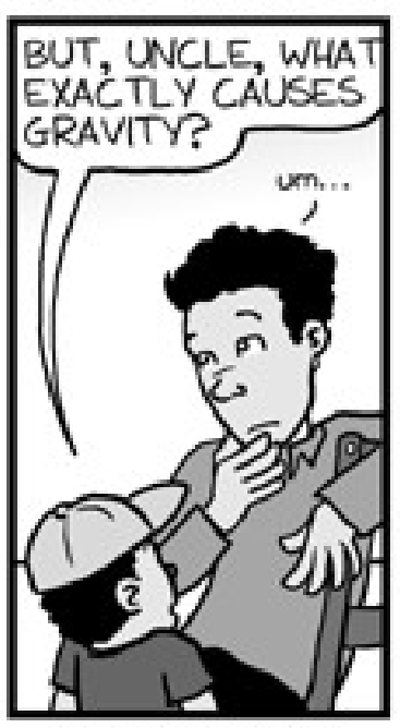
PHD IN PHYSICS