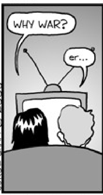
PHD IN POLITICAL SCIENCE