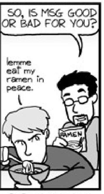
PHD IN BIOLOGY