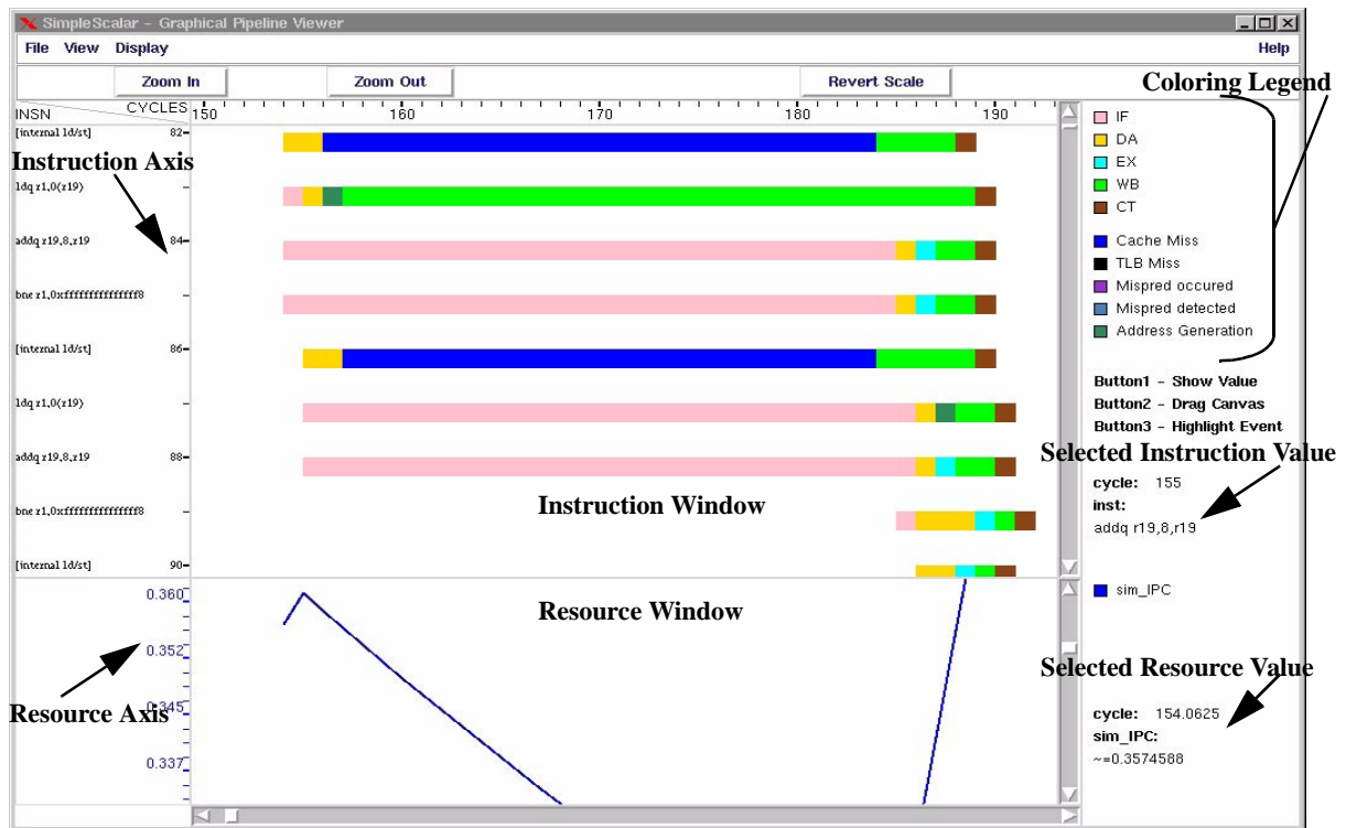
Figure 2 GPV Display Window showing the execution of instructions on a 4-wide Alpha ISA model (note that internal micro-code operations, i.e. internal ld/st, are allowed to finish out of program order)

The main GUI window of GPV is illustrated in Figure 2. The GUI has two main graphical display windows, the instruction window and the resource window. The instruction window plots instructions in program order on a time axis (measured in cycles). For example, the third instruction bar in Figure 2, shows the execution of an ADDQ instruction on a 4-wide Alpha simulator. As shown in the figure, this instruction is stalled in Fetch (IF) until the stall in the internal ld/st is resolved, after which it continues to completion. This method for graphing instructions as they flow through a pipeline is a common visual representation, used in many textbooks including Hennessy and Patterson [2]. The instruction axis contains tick mark to indicate the