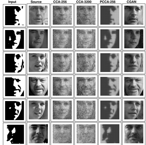
Fig. 4. Sample Mooney-to-Photo prediction results.

Related Works. Mooney-to-photo prediction is an interesting and challenging research topic in computer vision,