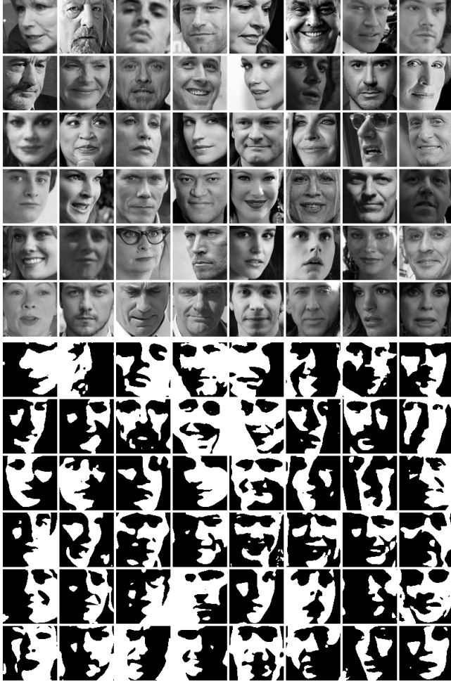
Fig. 3. Sample results from our Mooney face generator.

Large-scale Mooney face dataset. We generate 35 candidates for each source face photo from the 35 combinations of k and t . Our Mooney face classifier is used to pick out the most Mooney-like candidate. If that candidate has a low score, we reject the face photo. We build our large-scale Mooney face dataset based on Facescrub images. With a high Mooney score threshold to ensure the quality of such automatically generated Mooney faces without human judgement verification, we obtain a Mooney face dataset with 13,460 images of 523 identities, sample results shown in Fig 3.