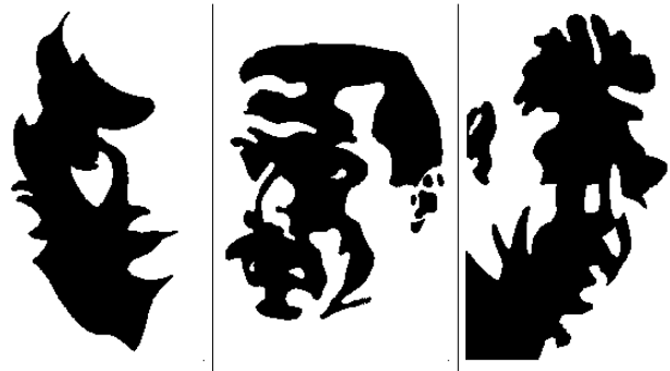
Fig. 1. Mooney faces are special two-tone images where humans can often effortlessly recognize the identity, age, gender, and facial expression of the person. It remains elusive how such rich perception can be achieved computationally.

Mooney faces may be challenging for both human and computer vision systems because the contours are ambiguous; it is not clear how they can be segmented into parts based on bottom-up image-level information alone. While it is trivial to extract the contours of a shadowy Mooney face, it is not obvious how to interpret or classify these contours. In a two-tone Mooney face, each contour could correspond to a meaningful structure of the face (what is sometimes called an attached shadow ) or to a less meaningful cast shadow border. Cast shadow borders depend on the nature and direction of the light