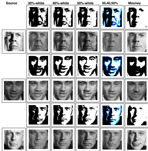
Fig. 5. Sample prediction results from two-tone inputs.