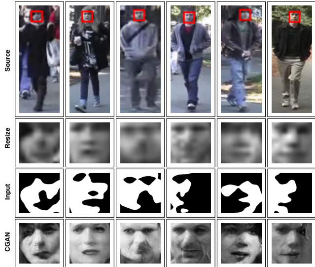
Fig. 6. Sample prediction results from surveillance photos.

Cross-Tone Prediction Results. Fig.4 shows grayscale face predictions and Table3 prediction errors. Our CGAN