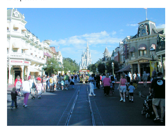
Figure 2: Main Street in Disney World's Magic Kingdom, with Cinderella's Castle in the background

Cinderella's Castle, the representative icon of the Magic Kingdom story, is visible in the distance (Figure 2). It is continually visible, and grows larger while moving toward the Magic Kingdom—a constant reminder of the story that we were entering. But in passing the Contemporary Resort on the right, we noticed cars in front of the resort. How did those cars get there? Then we noticed the tunnel under the waterway. In most places, if a road has to cross a waterway, the road goes over the waterway. But at Disney World, that would break the visual connection to the story, so the waterway takes precedence.