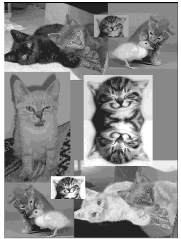
Figure 2: Example of Student Homework (Full color examples of student work can be found at: http://coweb.cc.gatech.edu/cs1315)

Many students were clearly excited about the potential for using media in ways they had not previously encountered. Two students reported on the midterm survey that they had written programs to reverse popular songs, in order to find out if there were hidden messages. One student reported using Python to create an online scrapbook. Students often turned in homework assignments that included far more complex code than was required. For one homework assignment, students were directed to create a collage in which the same image appeared at least three times with some different visual manipulation each time. As can be seen in the example in Figure 2 (which was showcased by voluntary public posting on the collaborative website), many students accomplished considerably more than the minimum requirements. Some programs reached over 100 lines in length.