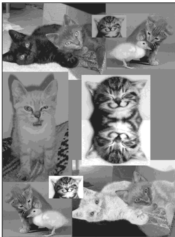
Figure 2: Example of Student Homework (Full color examples of student work can be found at: http://coweb.cc.gatech.edu/cs1315 )

Many students were clearly excited about the potential for using media in ways they had not previously encountered. Two students reported on the midterm survey that they had written programs to reverse popular songs, in order to find out if there were hidden messages. One student reported using Python to create an online scrapbook. Students often turned in homework assignments that included far more complex code than was required. For one homework assignment, students were directed to create a collage in which the same image appeared at least three times with some different visual manipulation each time. As can be seen in the example in Figure 2 (which was showcased by voluntary public posting on the collaborative website), many students accomplished considerably more than the minimum requirements. Some programs reached over 100 lines in length.