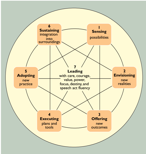
Figure 2. Anatomy of innovation.

standing Computers and Cognition , Terry Winograd and Fernando Flores wrote, “in this view language ... is no longer merely reflective but rather a constitutive medium. We create and give meaning to the world we live in and share with others.” This has profound implications. We can analyze a set of outcomes to reconstruct the conversation patterns that produced them. We can design and practice patterns that lead to the desired outcomes. If we don’t like the outcomes, we can modify the conversations we are in or we can enter into new conversations.