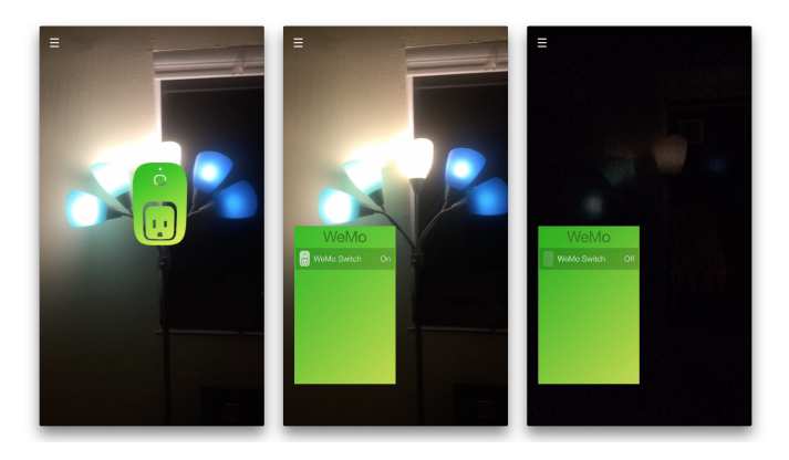
Figure 2: Screenshots of a demo implementation of a mobile augmented reality browser. In this proof-of-concept implementation, the smartphone camera identifies the target and displays an indicator (the favicon for the target's URL) which the user may touch to open the device's linked web interface. Once opened, the interface, an HTML web page, uses JavaScript and a local network protocol to allow the user to interact with the Wi-Fi-connected device, and toggle the light on or off.

Bluetooth as the designated origin, which could provide a URL to load a space's map on to the phone. This way, any smartphone or tablet entering the space can retrieve the appropriate local mapping instead of needing to rely on global geolocation.